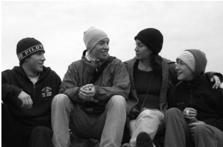
Photo taken when the two youngest were still in college and the oldest had already graduated.

My youngest son is a financial advisor and he needed calculus for his degree.